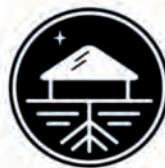
DreamHouse 'Ewa Beach